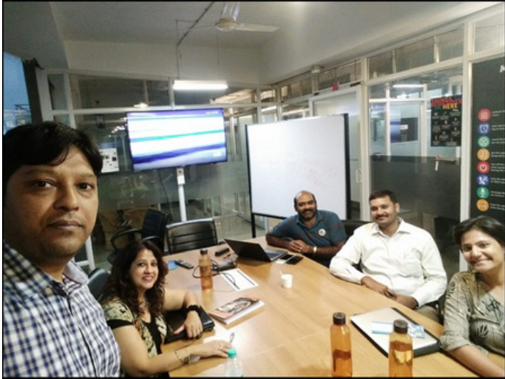
CCIS(Certified Counsellor for International Studies) Program in Bangalore