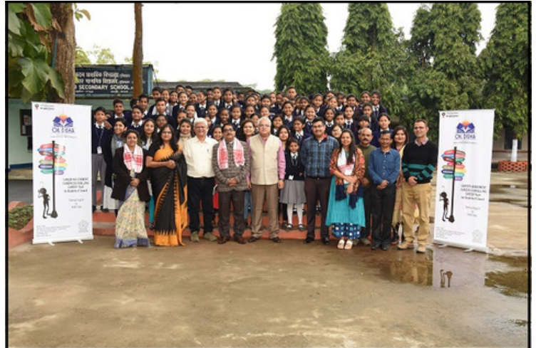
Assam State Projects