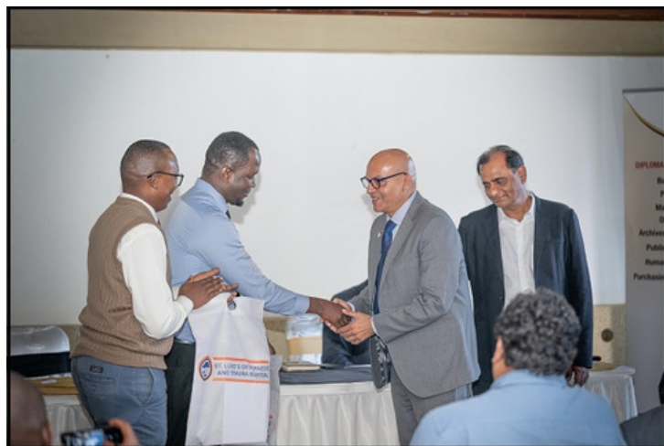
Edumilestones footprints in Kenya